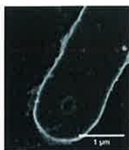
Fig 1. SEM image of a rectangular-shaped gold-covered SiN particle (thickness 200 nm)

focused laser beam under a commercial Raman microscope at a power density 30\text{mW}\mu\text{m}^{-2} , upon which dextran-rhodamin molecules were released from the capsule. This method enables to instantaneously monitor the release of the molecules through their Raman spectrum, as lowering the power density ( 2\text{mW}\mu\text{m}^{-2} ) allows to measure SERS spectra on the adjacent SiN chips in the same cell. Fig. 2(a) shows a transmission image of a cell containing three capsules and two disk-shaped SiN chips (dashed red arrows). This image was taken after the laser-triggered opening of the lowest capsule (yellow arrow). The release of the red-fluorescent dextran-rhodamin molecules is confirmed by confocal fluorescence microscopy (Fig. 2(b)), showing the leakage of the molecules out of the capsule. Fig. 2(c) compares the reference spectrum of the loaded molecules (measured in a 1 mg/ml solution, 30mW on sample and 4 minute integration time) with a SERS spectrum collected on top of the SiN chips ( 2\text{mW} , 0.5sec integration time) after capsule release. The presence of other peaks can be explained by the complex environment of the cell. It is important to notice that the imaged cell stayed alive during the entire experiment.